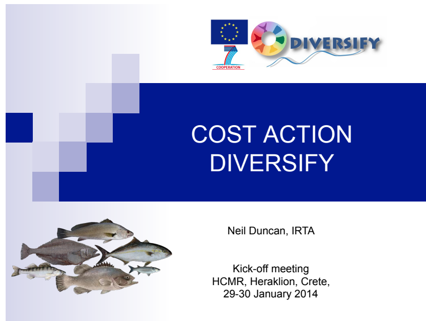
Figure 3. A proposal was presented to the consortium to submit a COST Action to support the research activities of DIVERSIFY.

Then Dr Neil Duncan (P3, IRTA) gave a brief presentation on the proposal to submit a COST action to support the research activities of DIVERSIFY (Fig. 3). The objectives of this COST action would be (a) to link as many researchers and stakeholders as possible in the area of species and product diversification in aquaculture and (b) to support the activities of DIVERSIFY in organizing meetings, supporting Short-Term Scientific Missions (STSM) among beneficiaries and the exchange of students and research personnel. The proposal for this COST action will be submitted in the Spring of 2014.