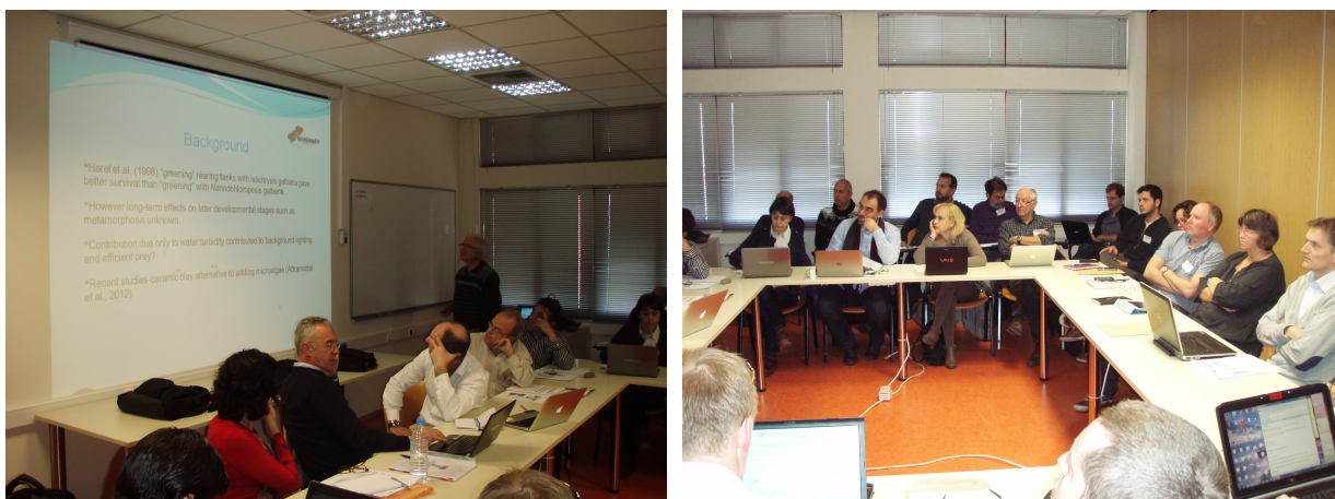
Figure 5. Attendance of the Workshop Sessions running in parallel ranged between 18 -28 scientists, depending on the Research Area.

An attempt was made to plan the sessions in a way that would minimize the potential time conflict for most Beneficiaries. This was also achieved by the participation to the kickoff meeting of more than one scientist from some of the beneficiaries that are involved in many GWPs. Each GWP leader was responsible for producing the minutes of the session, which were circulated among the participants for approval, before being submitted to the PC for compilation of the kick off minutes, which will be sent to the Beneficiaries for approval.