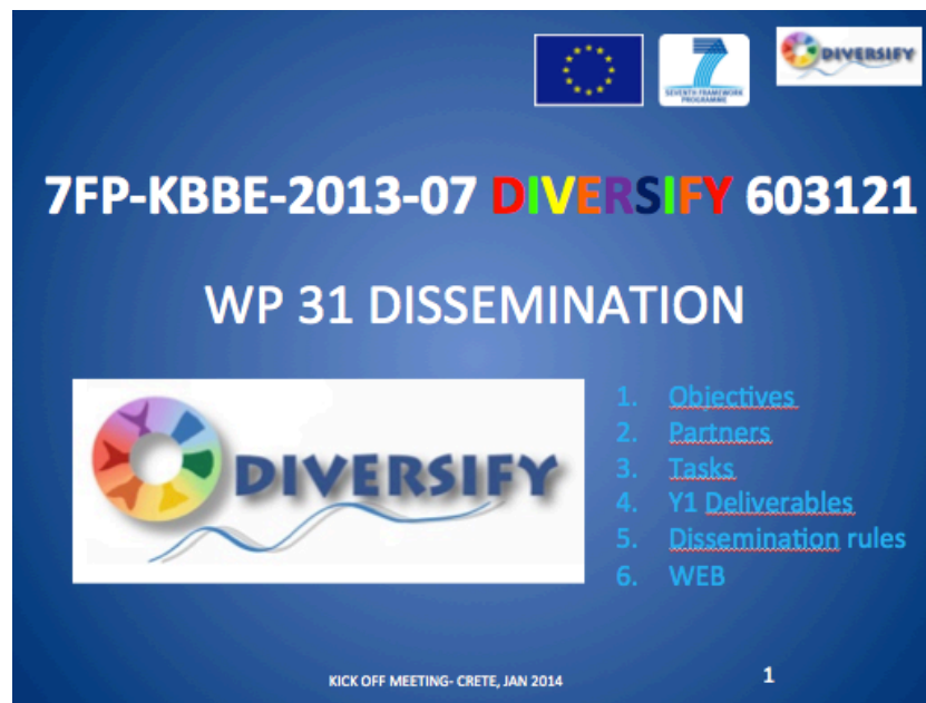
Figure 3. Table of Contents of the presentation of WP31 Dissemination by Dr. Rocio Robles of CTAQUA.