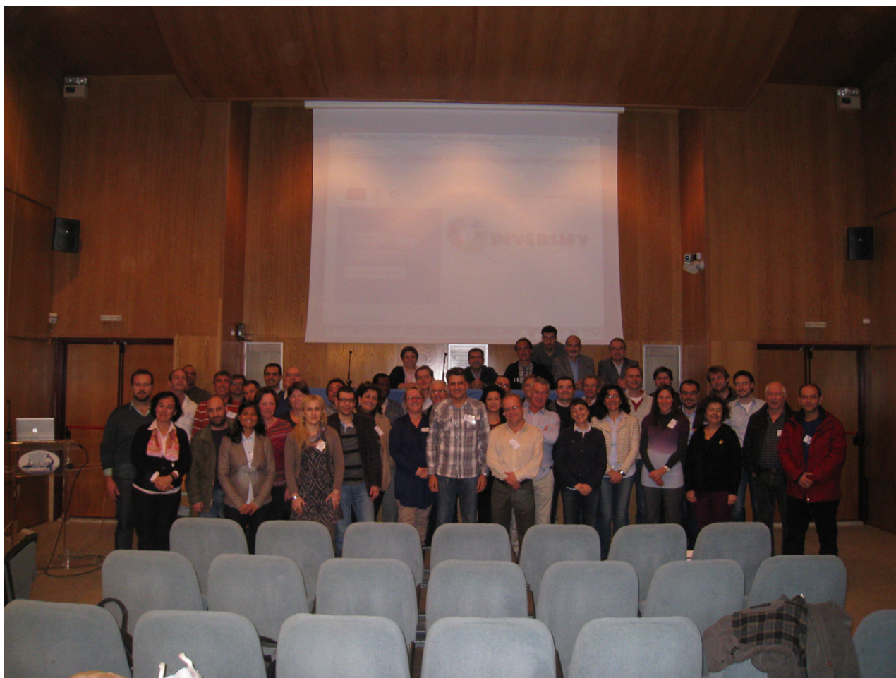
Figure 6. A group photo of the participants was taken at the conclusion of DAY 2. Unfortunately, some participants had to take a flight back to their countries, so the group is smaller than on DAY 1.