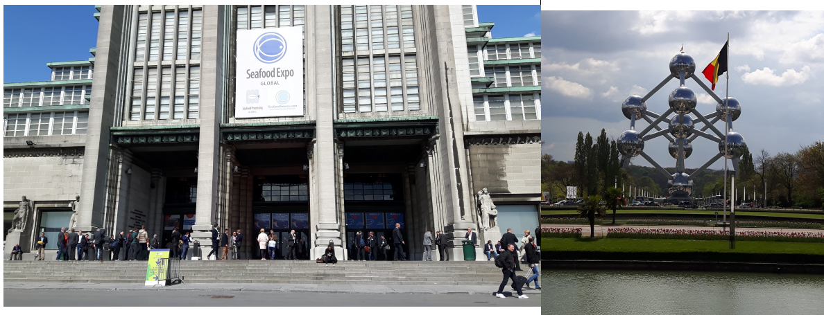
Figure 1. Entrance of the Seafood Expo Global and the Atomium located in the Brussels Expo area.