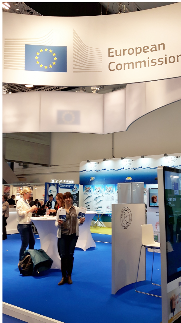
Figure 4. The dissemination leader at the stand of the EU during 2017 Seafood Expo Global.