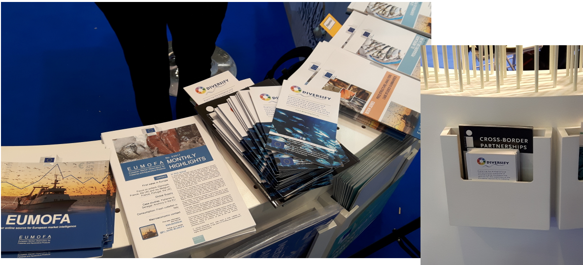
Figure 3. DIVERSIFY folders on the stand of the EU booth at the Seafood Expo Global 2017.