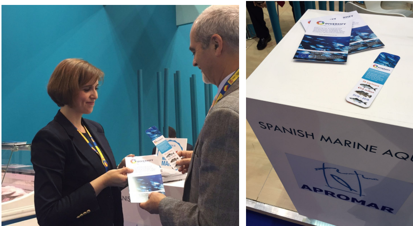
Figure 2. Seafood Expo 2016: DIVERSIFY dissemination material at the stand of APROMAR (P12).