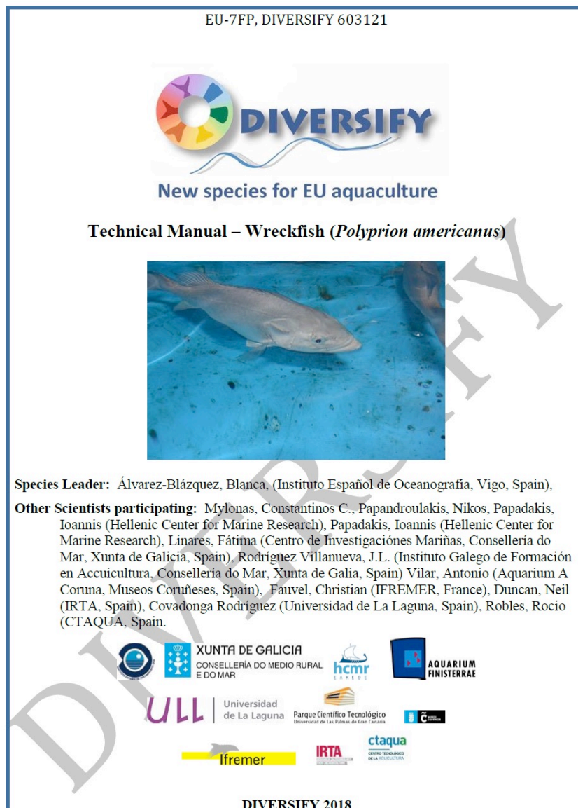
Figure 4. First page of the technical manual on wreckfish ( Polyprion americanus ) available in the project web https://www.diversifyfish.eu/wreckfish-workshop.html