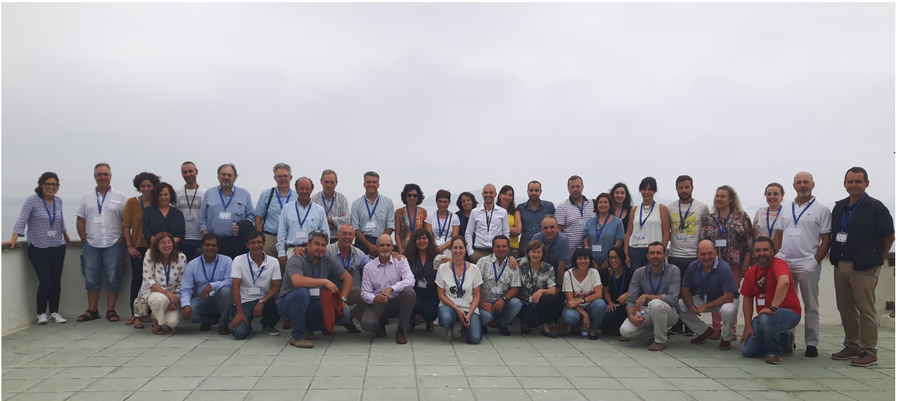
Figure 2. Group picture of the attendees to the meeting.