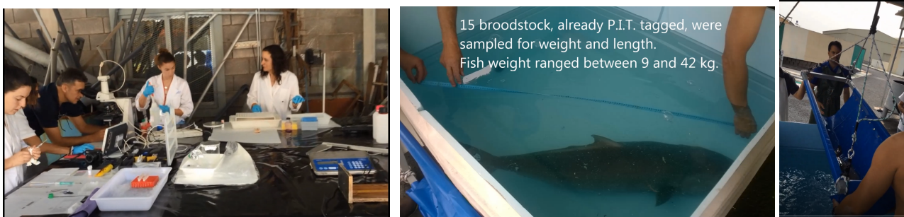
Figure 2. Different moments of the video showing the sampling set-up and the greater amberjack manipulation at IEO Tenerife, Spain.

In the following audiovisual material prepared for the project in November 2015, further advances in the areas of Reproduction and Genetics of meagre ( Argyrosomus regius ) and greater amberjack, as well as in the Larviculture husbandry of grey mullet ( Mugil cephalus ) among others, were included in the video. The Socioeconomic advances concerning the elaboration of new product ideas for the DIVERSIFY fish species and the consumer segmentation studies were also included in the video ( Fig. 3 ).