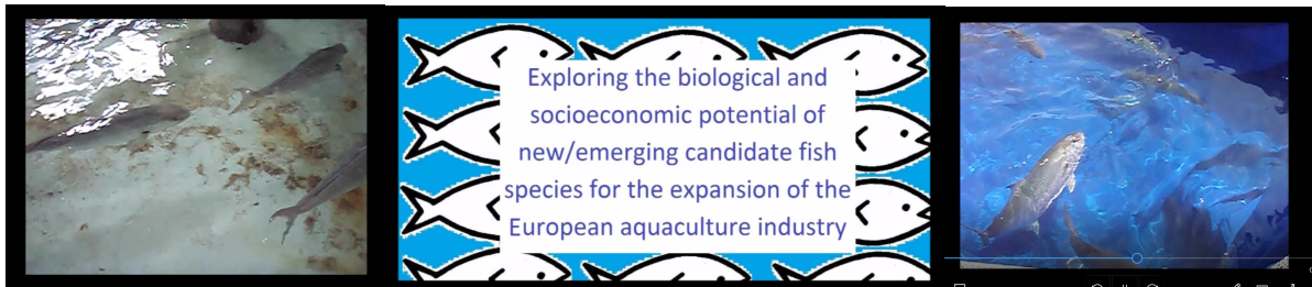
Figure 1. Desktop captures of some of the images from the first video produced for the broadcasting of DIVERSIFY project.