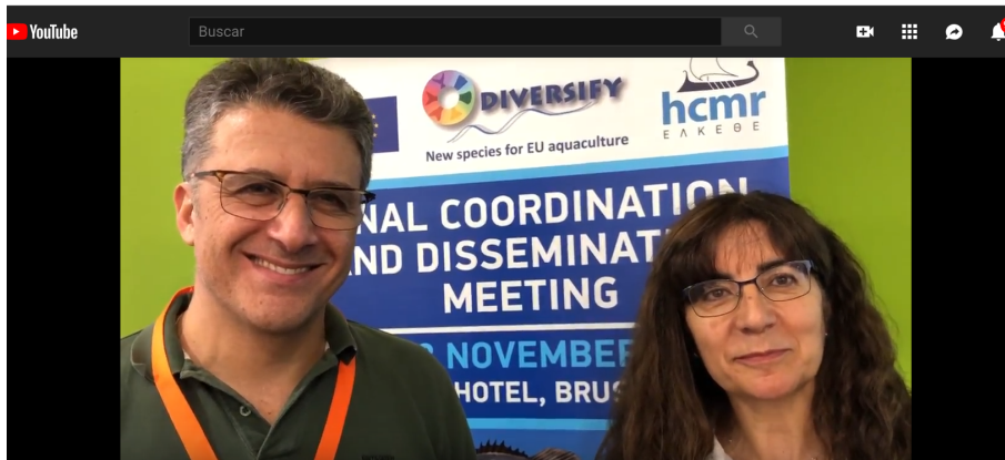
Figure 6. Image of the video recorded during the Final Coordination and Dissemination meeting held in Brussels, November 2018.

In 2018, during the Final Coordination and Dissemination meeting held in Brussels, a short video interviewing the project Coordinator and the Dissemination leader was produced by the Spanish Producer Association APROMAR. In just two minutes the final and main conclusions of the project were presented to the industry and further contact and information to the farmers was offered, not only from the project website but also via direct contact with any of them ( Fig. 6 ).