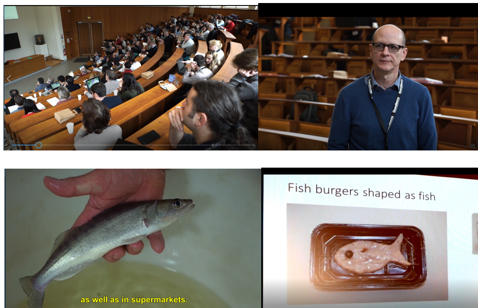
Figure 4. Screen shots of the video prepared with the occasion of the second annual Coordination meeting in Nancy, France (2016).