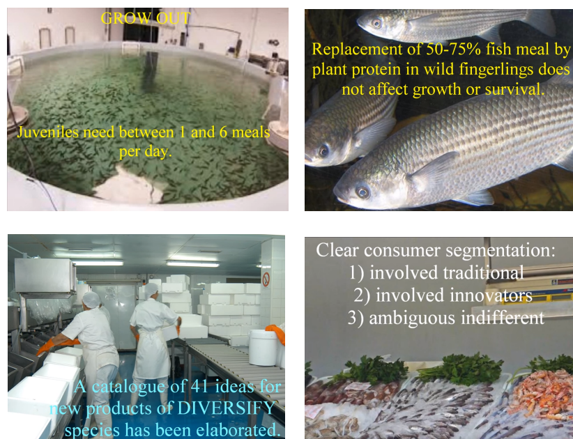
Figure 3. Images of the November 2015 video presenting some of the results with greater amberjack and grey mullet, and the work done in the Socioeconomic area (bottom images).

In the following audiovisual material prepared for the project in November 2015, further advances in the areas of Reproduction and Genetics of meagre ( Argyrosomus regius ) and greater amberjack, as well as in the Larviculture husbandry of grey mullet ( Mugil cephalus ) among others, were included in the video. The Socioeconomic advances concerning the elaboration of new product ideas for the DIVERSIFY fish species and the consumer segmentation studies were also included in the video ( Fig. 3 ).