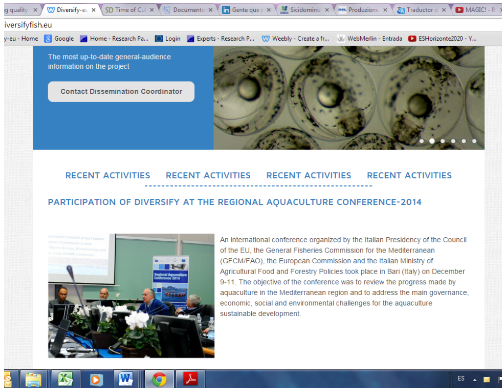
Screen shots of the latest activity: the participation of DIVERSIFY at the Regional Aquaculture Conference 2014 held in Bari, Italy, last December (NEWS page of the www.diversifyfish.eu web site).