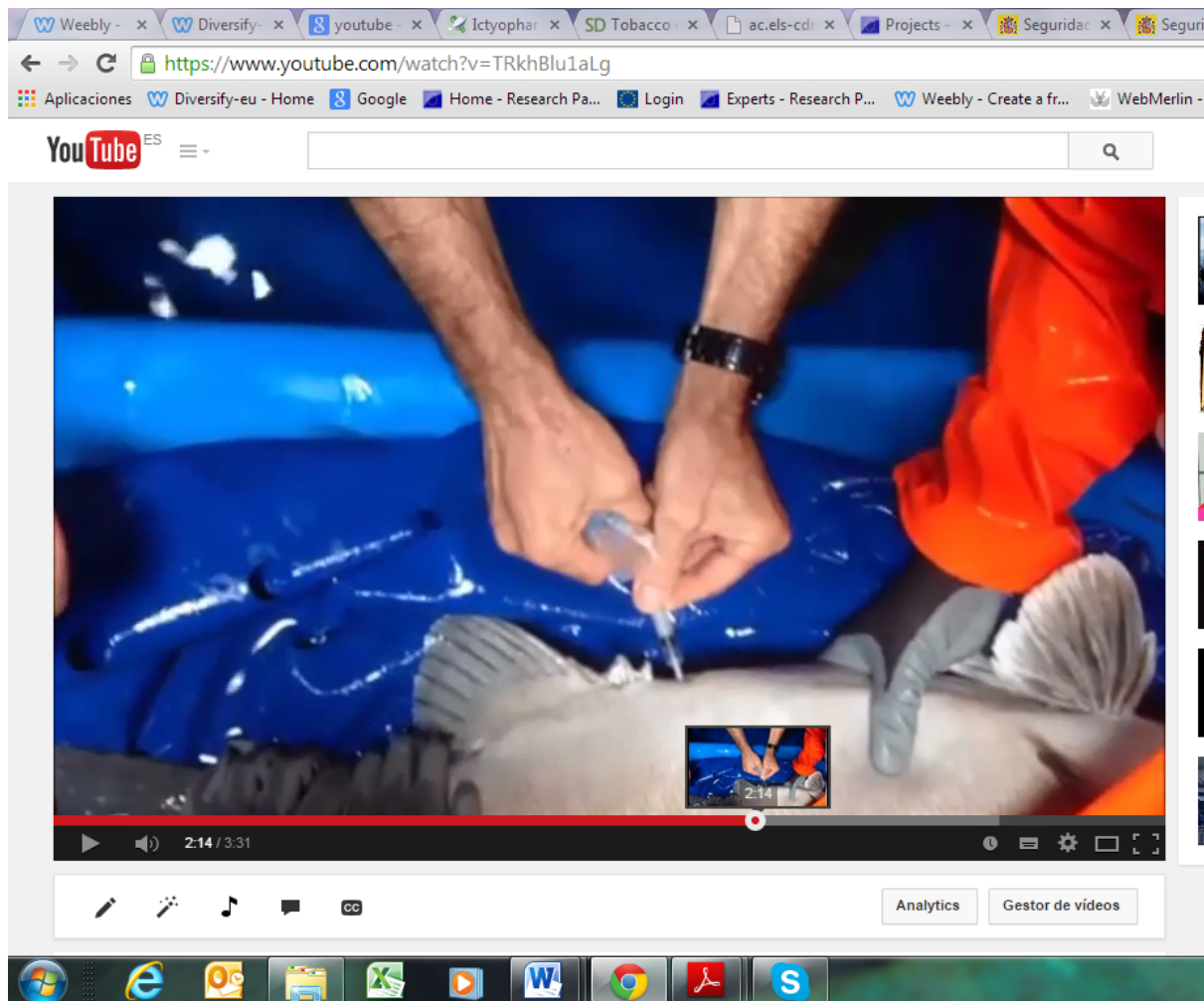
Desktop capture of wreckfish sperm collection movie, included in the DIVERSIFY video.

The video starts with a short introduction of the project. Then the most significant achievements in the GWP Reproduction & Genetics is presented, with some photos and videos from the capture and sampling of greater amberjack from the wild, in order to describe the reproductive cycle of the species. Also, the successful spawning and larval rearing of greater amberjack is highlighted. A movie of the sampling of mature wreckfish from the Aquarium “A Coruña” in Spain is included, describing the work on the development of Computer Assisted Sperm Analysis (CASA) for this species, as well as the other species included in DIVERSIFY. The video ends with the Annual Coordination Meeting held in November 2014 in Bari, Italy and mentioning the presence of DIVERSIFY in the next Aquaculture Europe 2015 conference to be held in Rotterdam (Netherlands).