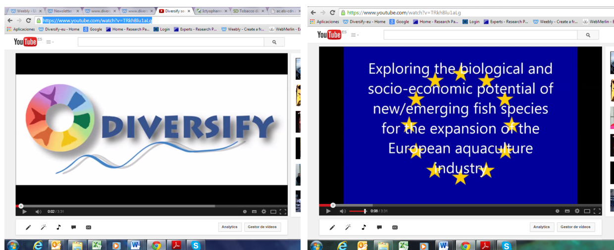
Screen shots of the first two sequences of the DIVERSIFY video.

Description: A promotional video including a summary of the main project activities during the first year has been produced and uploaded in the DIVERSIFY web and in YouTube ( www.diversifyfish.com , https://www.youtube.com/watch?v=TRkhBlu1aLg ). The video presents an overview of the GWP Reproduction & Genetics activities. Although experimental work on reproduction has been carried out also in meagre and Atlantic halibut, the video summarizes the work on greater amberjack and wreckfish.