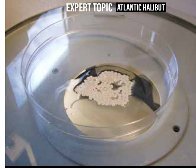
Figure 3: Oocytes examined under a stereoscope for developmental stage

Implantation with gonadotropin releasing hormone agonist (GnRHa) did not advance