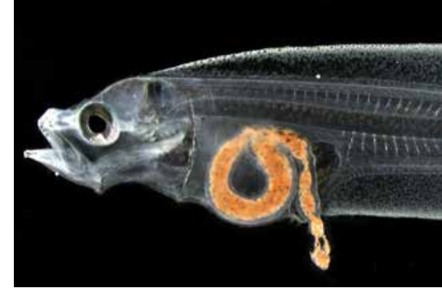
Figure 4: First feeding stage larva