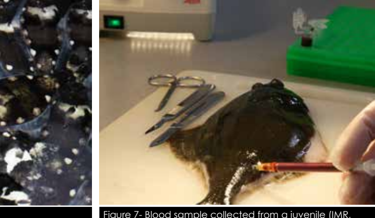
Figure 7- Blood sample collected from a juvenile (IMR, Norway)

protein (GFP), it could be visualised by fluorescence microscopy that Artemia filtered efficiently and ingested these microbes, and thereby the harboring recombinant protein.