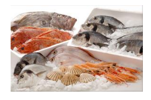
Processed fish. products